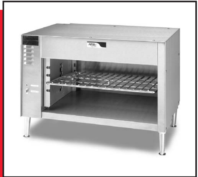
Model CMC Cheese Melter

Unit construction is stainless steel with 4" heavy-duty legs as standard, on Counter Mount and Pass-Through models. Top, sides and back (except pass-through model) are fully insulated with high quality insulation. Powermiser control allows unit to maintain standby level with 25% of heating capacity. Unit has four shelf height "microswitch" that is activated by placing a plate on the shelf, which provides ultimate finishing capabilities. All controls are solid-state with electrical fan-cooled compartment. Infrared heaters are easy to snap-in and out. All hardware is stainless steel. All units are single phase.